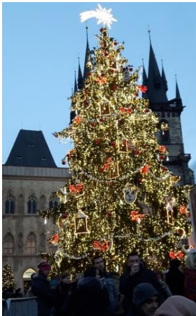
Christmas tree, Old Town Square, Prague December 2016

We have come to the end of another year. As it turned out, 2016 was a rather tumultuous year in the international arena. There were so many momentous happenings to absorb that one sometimes felt buffeted by storm winds. Perhaps history will one day judge it as the year that defined the beginning of a starkly new direction. But time will tell.