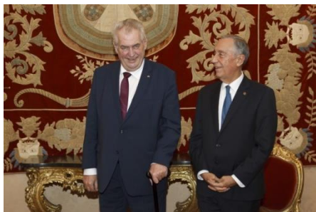
Czech President Miloš Zeman and Portuguese President Marcelo de Sousa, Lisboa, 14 December 2016.

President Miloš Zeman paid a State Visit to Portugal on 14 December 2016. He met his Portuguese counterpart Marcelo de Sousa, visited the parliament and opened an exhibition on King of Bohemia and Roman Emperor Charles IV.