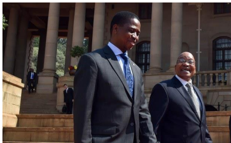
President Zuma welcomes President Lungu at the Union Buildings.

Zambian President Edgar Lungu paid a State Visit to the RSA from 07-09 December 2016.