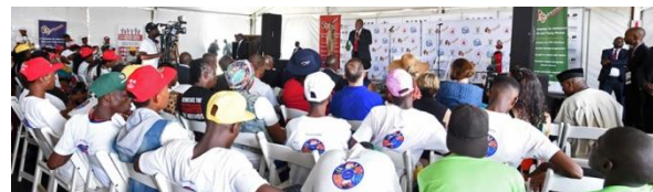
Deputy President Cyril Ramaphosa addressing the 2016 World AIDS Day Commemoration at Sinabala Stadium in Daveyton, Gauteng