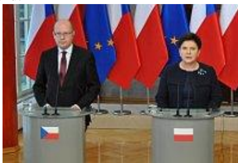
Joint press conference of PM Bohuslav Sobotka and Beata Szydlo, Wisla, Poland, 12 December 2016.

between Ostrava, North Moravia, and Kozle, Poland.