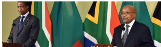
President Jacob Zuma with the President of the Republic of Zambia Edgar Lungu during the press conference, Union Buildings.

South Africa and Zambia's economic relationship continues to grow; over 120 South African companies are doing business in Zambia. The two Presidents addressed a Business Forum attended by more than 150 businessmen from both countries.