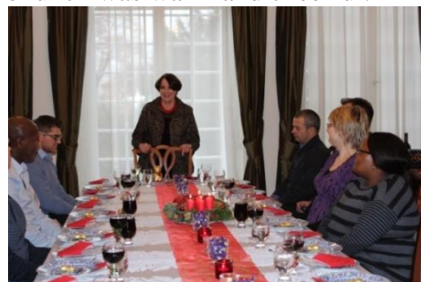
The Ambassador welcomes the staff at the Residence

Ambassador hosted the traditional Christmas lunch for the Embassy staff at the Official Residence on 13 December 2016. Staff members contributed typical Christmas dishes and other delicacies. The atmosphere at the lunch was warm and cheerful.