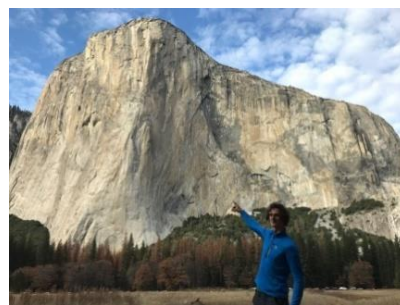
Adam Ondra and El Capitan.

Adam Ondra (23), a world champion Czech climber, achieved the second free ascent of Yosemite's hardest big-wall free climb, the Dawn Wall, in the record time of eight days from 14-21 November 2016.