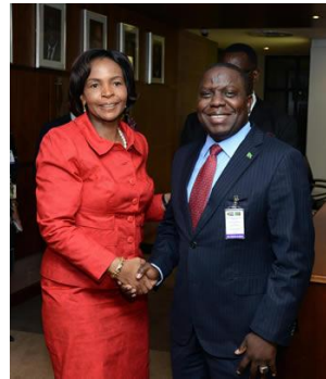
Ministers Ms Maite Nkoana-Mashabane and Mr Harry Kalaba during the South Africa - Zambia Joint Commission of Cooperation (JCC), Pretoria, 7 December 2016.

Africa-Zambia Joint Commission of Cooperation (JCC) in Pretoria on 07 December 2016.