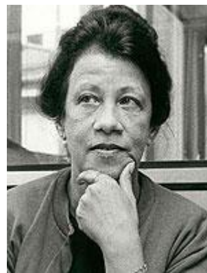
The late Ms. Dulcie September

In order to commemorate the life of Ms. Dulcie September, a freedom fighter and human rights activist assassinated in 1988 in Paris, a webinar was organized