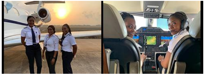
All-female cabin crew in South Africa